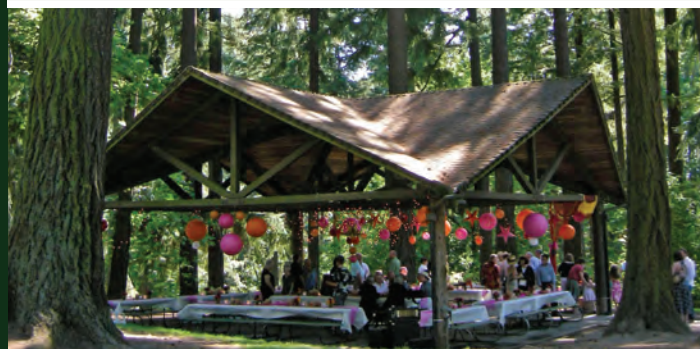
Picnic Area “A”