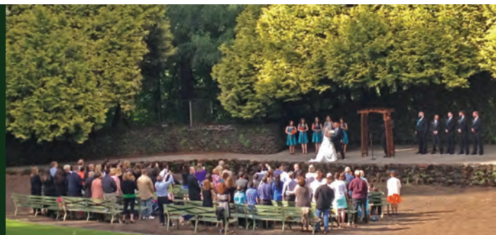
Wedding in the caldera