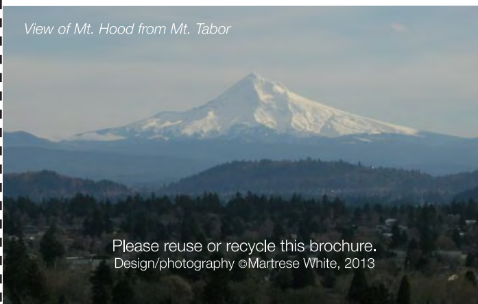
View of Mt. Hood from Mt. Tabor

Please reuse or recycle this brochure.