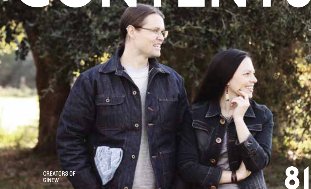
CREATORS OF GINEW