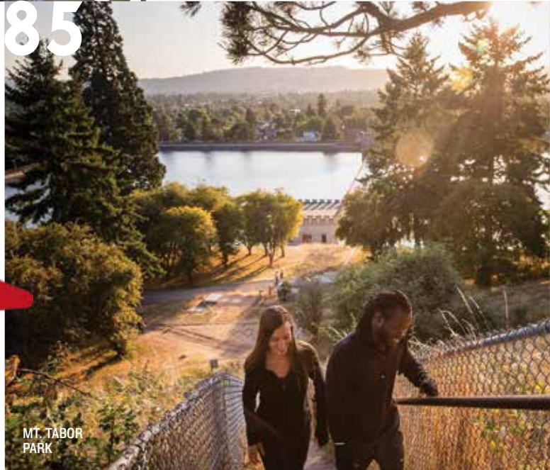
MT. TABOR PARK