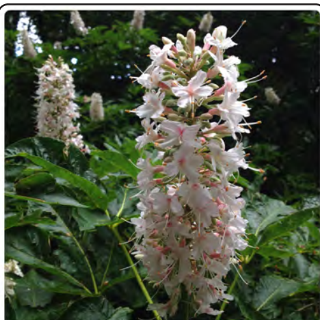
WHAT: Bottlebrush Buckeye WHEN: June WHERE: SE Salmon Way