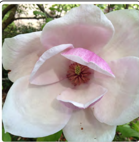
WHAT: Magnolia WHEN: late April–May WHERE: basketball court, Reservoir 1, Harvey Scott statue, E&N Tabor Drives