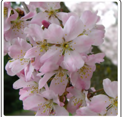
WHAT: Flowering Cherry Tree WHEN: March–April WHERE: Reservoirs 1 & 5