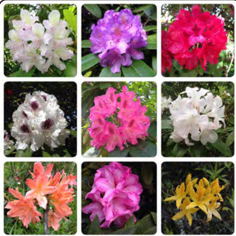
WHAT: Azalea and Rhododendron WHEN: late April–May WHERE: Reservoir 1, Picnic Area A, west tennis courts, north entrance, red trail