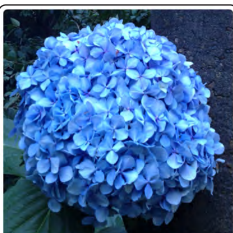
WHAT: Hydrangea WHEN: July/August WHERE: playground, Picnic Area A