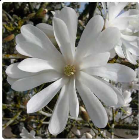
WHAT: Star Magnolia WHEN: early March WHERE: trail north of Reservoir 5