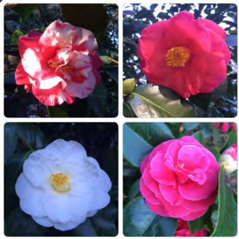
WHAT: Camellia WHEN: late February WHERE: north/69th & SE Salmon St. entrances